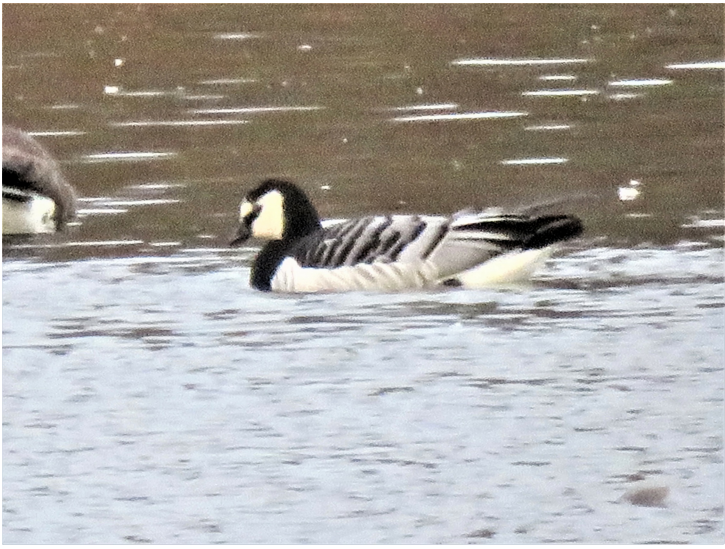
Barnacle Goose Peace Valley Pk. 12-4-2018 (2).JPG