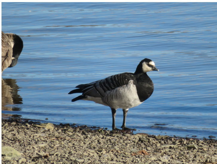
Barnacle Goose 12-4-2018 Peace Valley Pk. (2).JPG